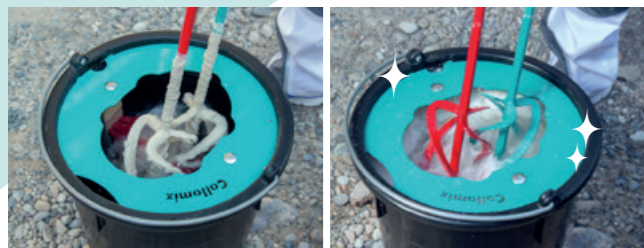
Illustration similar to actual product